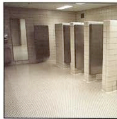
Sanitizers, Disinfectants and Cleaners