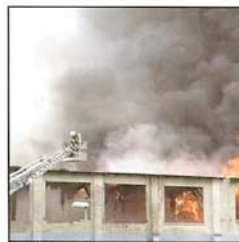
Smoke Cleanup and Odor Control