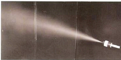
MAGNETspray's high speed air stream, coupled with the electrostatic charge, is the key to consistent, uniform coverage with less waste.