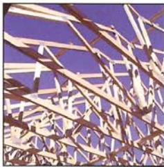
New Construction and Wood Sealants & Coatings