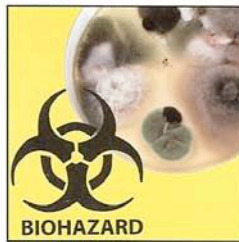
Mold and Biohazard Remediation